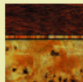
Mahogany with Piopo

We want your PURO humidor to be a perfect fit. If you still question which finish is best for your setting, we will gladly send you wood samples to preview to get the exact finish you want.