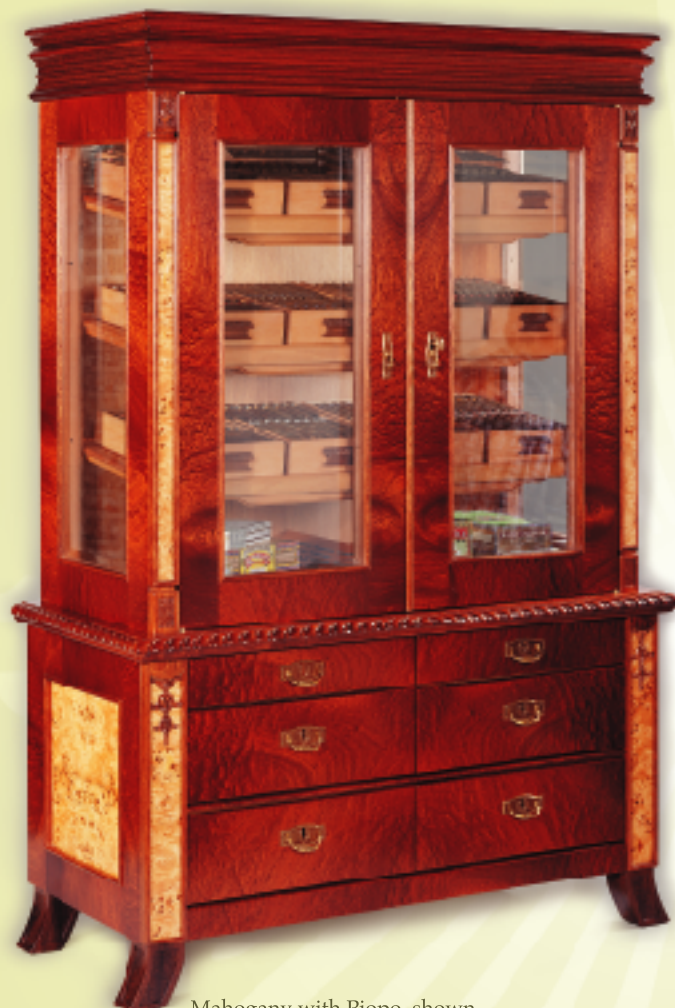
Mahogany with Piopo shown Temperature and Humidity Controlled